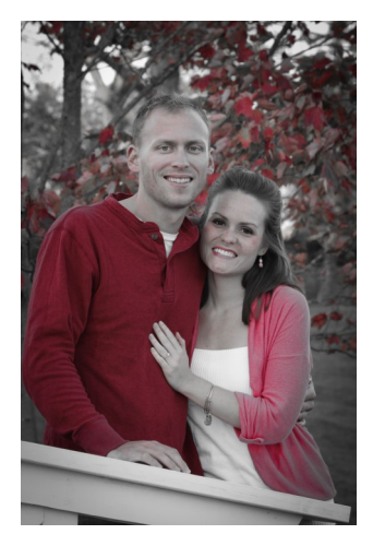
Choose your outdoor location for a personalized session!

Choose a location that tells the world who you are! And let our professional experience create a memory you'll treasure forever.